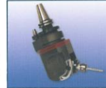
UNIVERSAL ANGLE HEADS