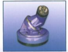
UNIVERSAL ANGLE HEADS