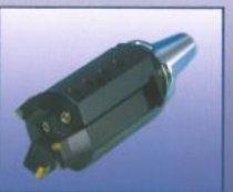
TURN - MILL TOOLING