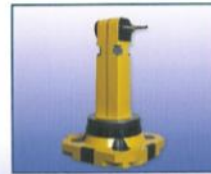
SPECIAL & EXTENDED