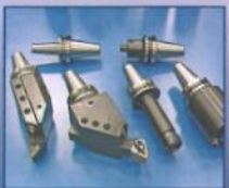
TURN - MILL TOOLING