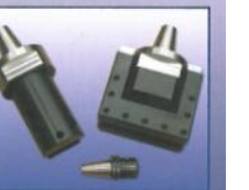
VERTICAL TURNING -