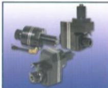
VDI DRIVEN TOOLING