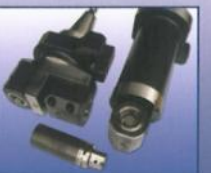
VERTICAL TURNING - SPECIAL