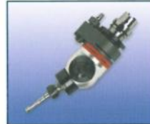
FIXED ANGLE HEADS