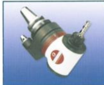
RIGHT ANGLE HEADS