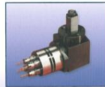
SPECIAL DRIVEN TOOLS