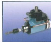
VERTICAL BORING HEADS