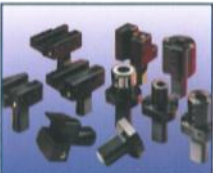
VDI STATIC TOOLING